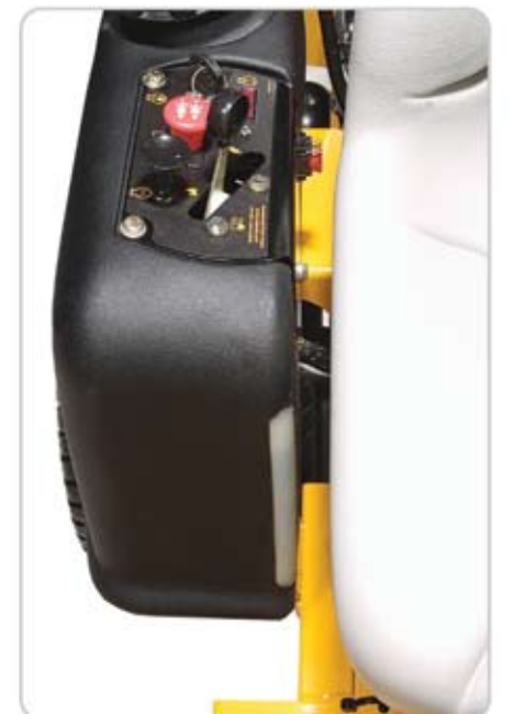
The fuel tanks come with an integrated site gauge allowing you to check your fuel level at a glance